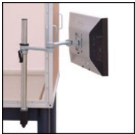
Click to Enlarge Monitor Mounted via a PSY403 External Post Adapter, a PSY161 Post, and a PSY121 Monitor Support Bracket

The PSY403 External Post Adapter allows our ScienceDesk™ Stainless Steel Posts to be mounted outside of the Faraday enclosure. The adapter bolts to the upper rails of a ScienceDesk frame and provides a single post-mounting through hole. Common applications of this adapter include mounting a PSY132 keyboard holder, attaching a PSY191 instrument shelf, or mounting a monitor via a PSY121 monitor support bracket, as shown in the photo to the right.