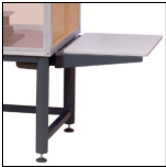
Click to Enlarge PSY350 Side Shelf Mounted via the PSY401 Post and Side Shelf Adapter

The PSY401 post and side shelf adapter maximizes the mounting capabilities when using a ScienceDesk™ with a Faraday enclosure. It offers seven through holes for ScienceDesk™ stainless steel posts and allows for use of our post-mounted ScienceDesk accessories. Additionally, this adapter allows the PSY350, PSY352, or PSY353 side shelf to be attached to a ScienceDesk frame equipped with an enclosure, thereby providing a large work surface separate from the isolated experiment, as shown in the photo to the right.